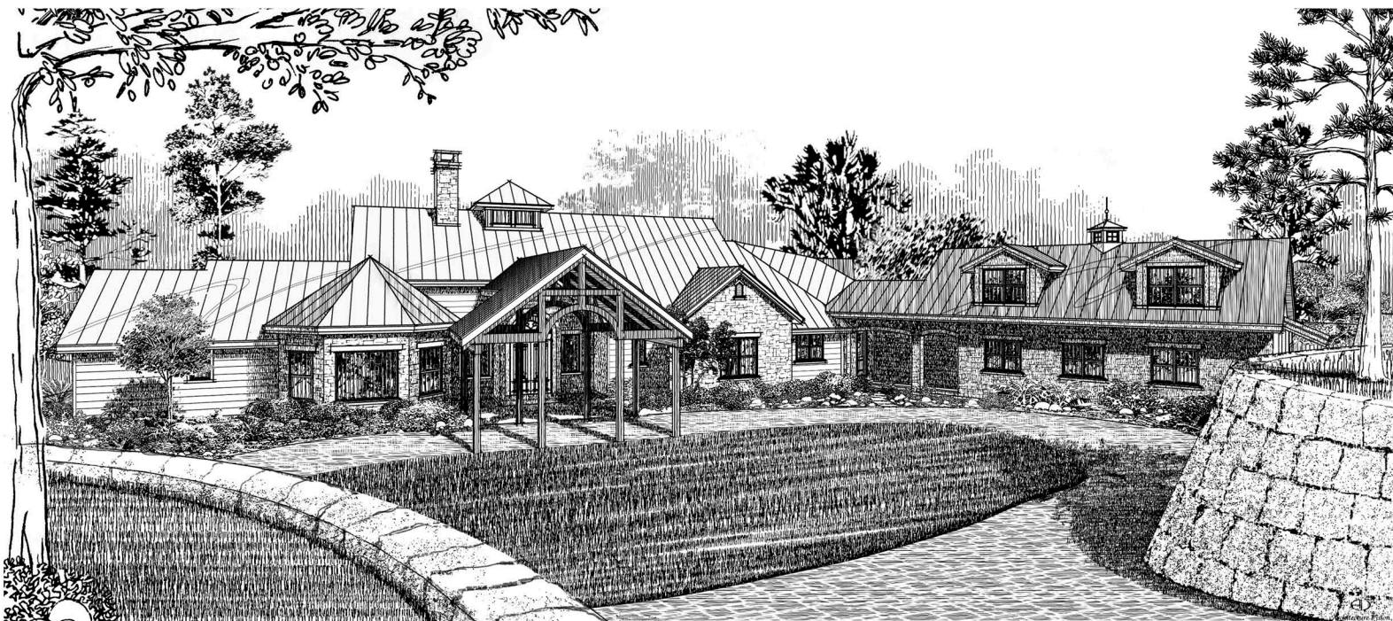
3D Perspective Views

This traditional rendering style is ideal for plan coversheets and black and white publications. It is an economical way of communicating the architecture to laymen. Working from your CAD drawings, we simplify the elevation or plan, or create a 3D model for the purpose of view selection. The clean drawing is then passed on to the artist for the application of texture, shading and nomenclature. Completed renderings are usually delivered electronically, though print and CD outputs are available